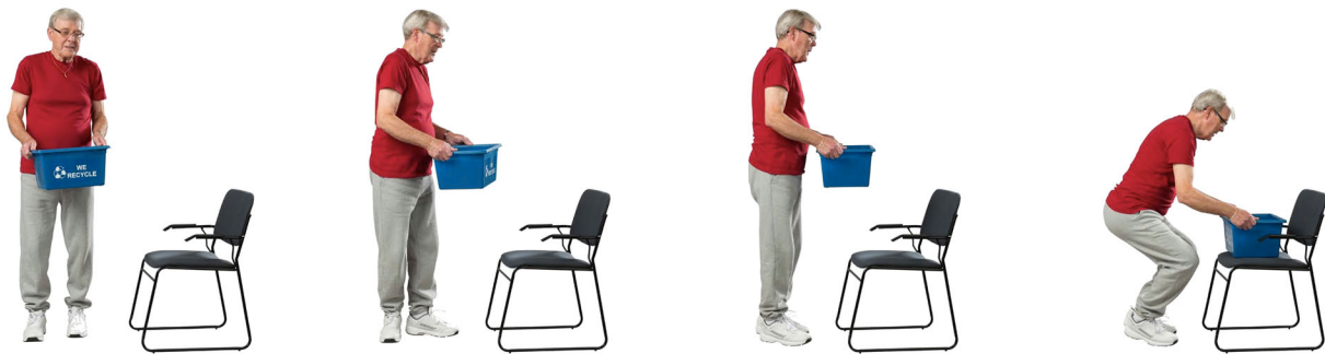
Note step-to-turn above

Hold the item in front of and close to your body.